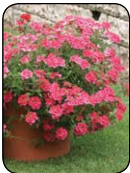
Verbena Lanai Strawberry and Cream