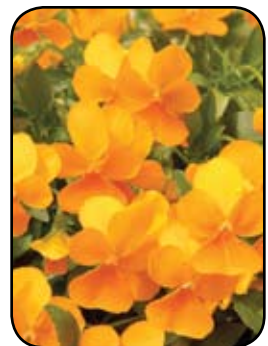
Viola Violina Orange