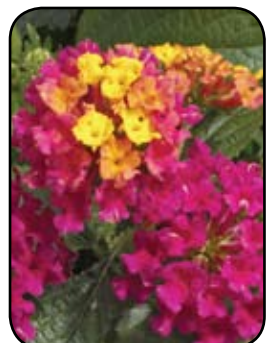
Lantana Bandana Cherry Sunrise