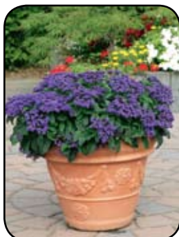
Heliotrope Scentropia Dark Blue