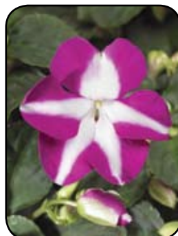
Impatiens Spellbound Blackberry Star