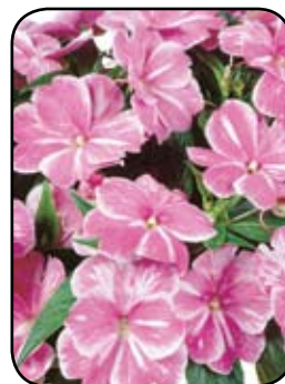
N.G. Impatiens Sonic Magic Pink