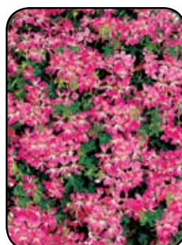
Geranium Cascade Acapulco Compact