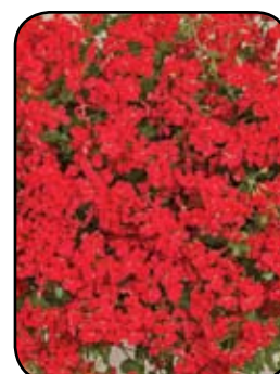
Geranium Red Blizzard '11