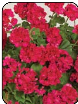
Geranium Americana Violet '11