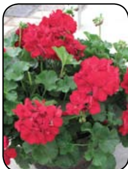
Geranium Calliope Dark Red