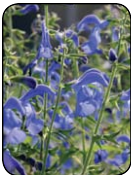
Salvia Patens Oceana Blue