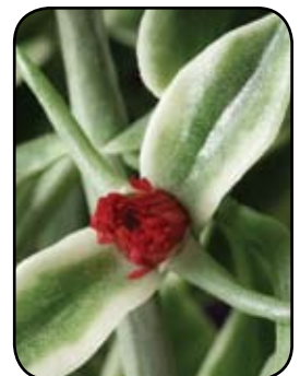
Dorotheanthus Mezzo Trailing Red