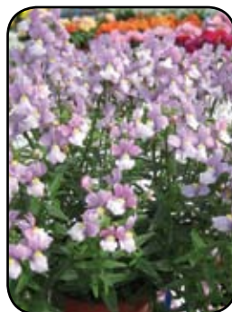
Nemesia Confection Pink