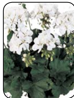
Geranium Tango White