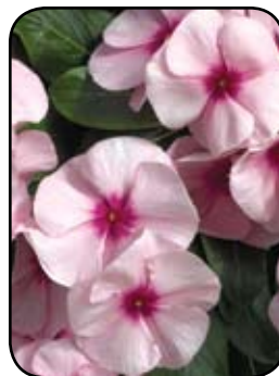
Vinca Nirvana Cascade Pink Splash