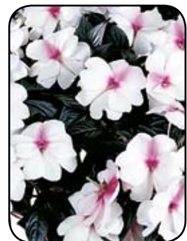
N.G. Impatiens Super Sonic Cherry Cream