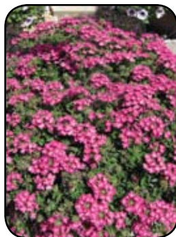
Verbena Magalena Plum Frost