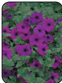
Petunia Surfinia Wild Plum