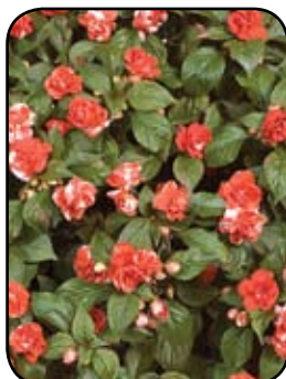
Impatiens Silhouette Orange Star