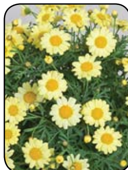
Argyranthemum Sassy Compact Yellow