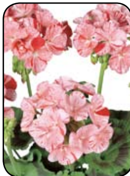
Geranium Classic Mosaic Red