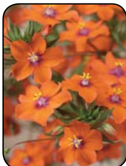
Anagallis Angie Orange