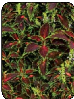
Coleus Mosaik Rose Blast