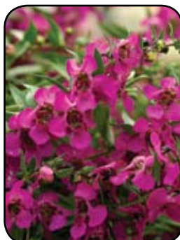
Angelonia Carita Raspberry