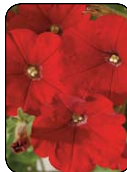
Petunia Whispers Red '11