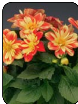
Dahlia Goldalia Orange '10