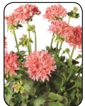
Geranium Graffiti Double Salmon