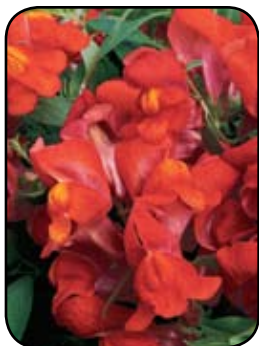
Snapdragon Sultan Bronze