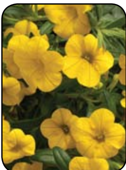
Calibrachoa Callie Deep Yellow