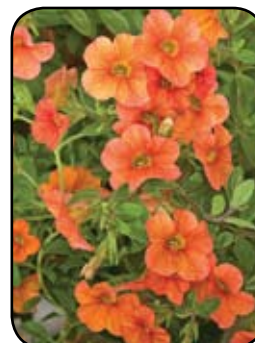
Calibrachoa Callie Orange Sunrise