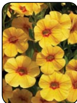
Calibrachoa Callie Gold with Red Eye