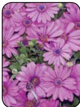
Osteospermum Tradewinds Purple Bicolor