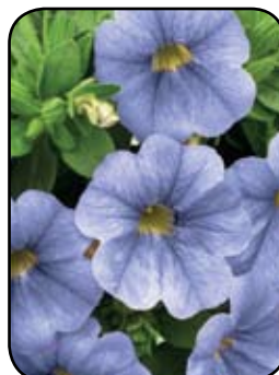
Calibrachoa Callie Light Blue