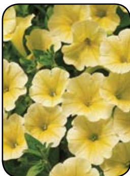
Petunia Surfinia Patio Yellow