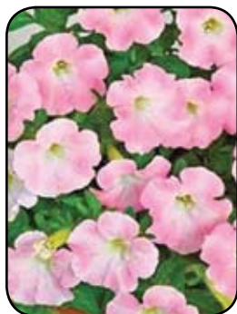
Petunia Picnic Light Pink