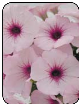
Petunia Sanguna Pink Vein