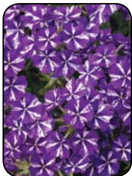
Verbena Lanai Purple Star