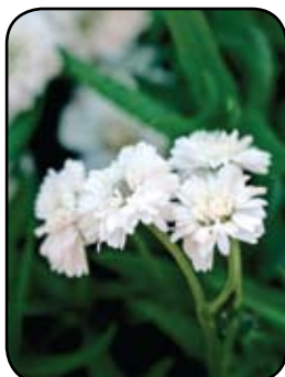
Achillea Gypsy White