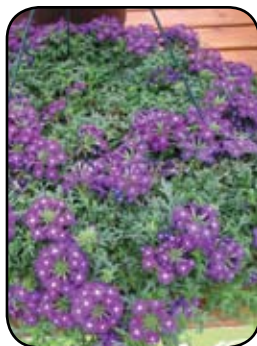
Verbena Magalena Purple w/ Eye