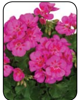
Geranium Fidelity Deep Lavender