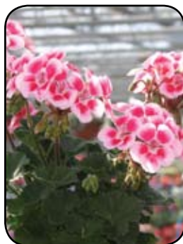
Geranium Tango Rose Mega Splash