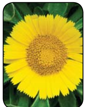
Asteriscus Aurelia Gold