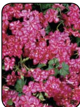
Geranium Contessa Purple Bicolor