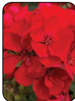
Geranium Tango Velvet Red