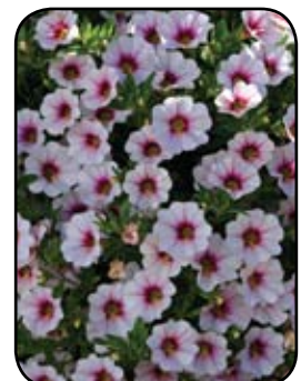
Calibrachoa Callie White w/ Rose Vein