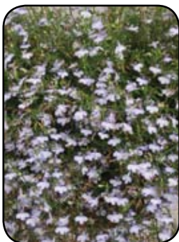
Lobelia Techno Heat Light Blue `11