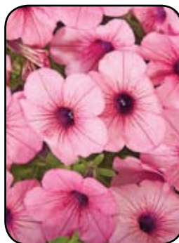
Petunia Whispers Lavender Eye