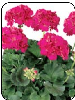
Geranium Rocky Mountain Salmon Rose