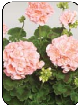
Geranium Classic Salmon