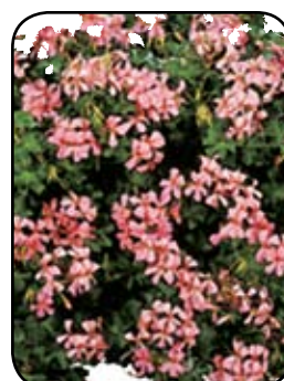
Geranium Sofie Cascade