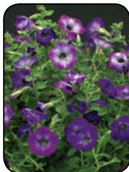
Petunia Sanguna Atomic Blue