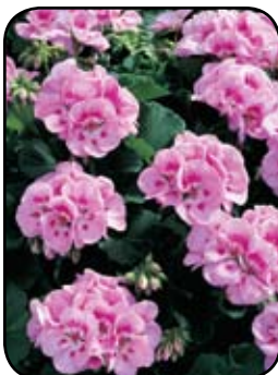
Geranium Americana Lt Pink Splash