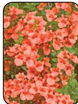
Diascia Darla Deep Salmon