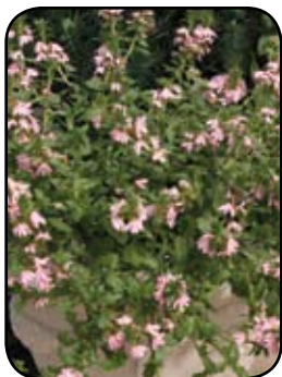
Scaevola Bombay Pink