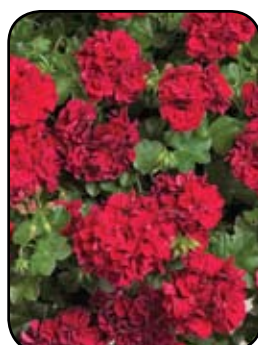
Geranium Temprano Dark Red '11